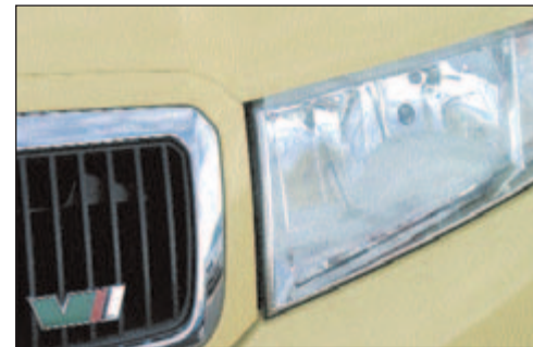
The vRS badge. Becoming VERY desirable.

World leaders in engine management tuning Tel: +44 1280 816781 or visit www.superchips.co.uk