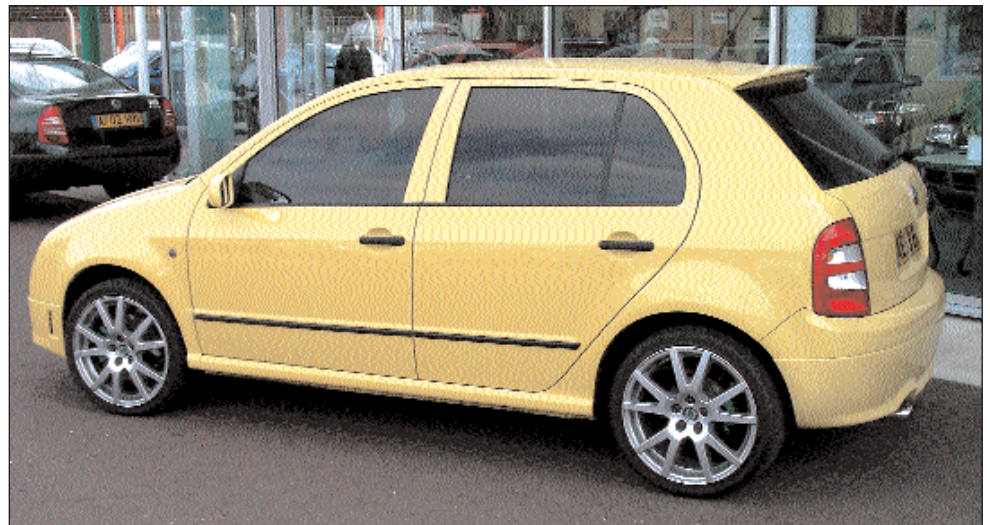
Take the racy Fabia vRS and then re-write its 'chip' and you can make a fast car fly! No really!!

I wasn't able to clock any accurate performance figures, but the power and torque boosts undoubtedly put the converted car up there with the big boys. Knock a modestly hypothetical 20 per cent off the vRS's