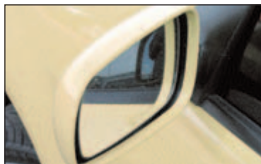
The only place you'll ever see a 330 again.

"You're looking at 0-60mph in well under eight seconds (the owner has clocked 7.2 seconds several times.)"