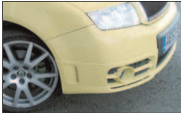
Hot Wheels: Say goodbye to BMW 330ds

factory figures and you're looking at 0-60mph in well under eight seconds, (the owner has clocked 7.2 seconds several times) together with in-gear (30-50mph in 4th, 50-70mph in 5th) acceleration figures that are going to be more than a match for our quickest-tested BMW 330d's 4.7 and 6.8 seconds. It bears repeating - this Fabia is very seriously quick! What impresses as much as the pure performance improvement, is the way that the car easily handles its extra oomph, whilst still preserving a very civilised level of general refinement. The exhaust note and engine noise remain strictly business-like but not intrusive, and the engine remains totally free of temperament. Even the steering feel avoids the nastier side-effects of high power in some FWD cars, remaining informative yet not hyperactive, and the ride comfort remains surprisingly good - in spite