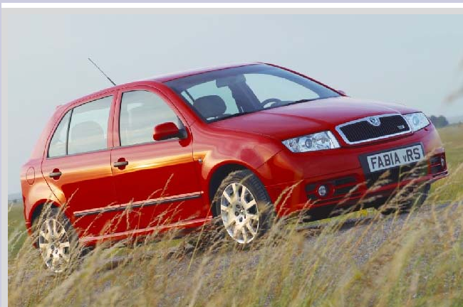
Pictures shown illustrate a variety of models from this range Click for more online