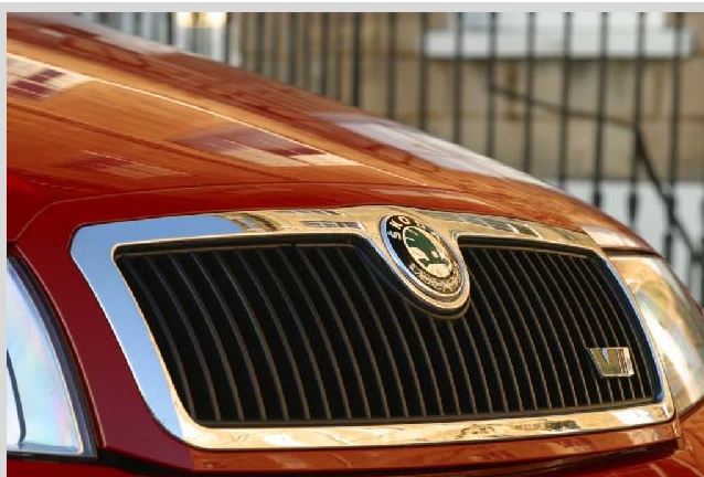
Pictures shown illustrate a variety of models from this range Click for more online