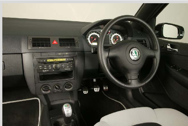
Pictures shown illustrate a variety of models from this range Click for more online

From behind the wheel, the Fabia vRS will be familiar to current VW, Audi and SEAT buyers - although the showy detail has been removed. The no-nonsense approach is retained for the layout: all the switches and buttons are exactly where they should be. The speedo is a bit of an anomaly - it counts every ten mph to 90mph, then suddenly jumps to 110 mph, then 130mph as the next increments. The seats are very supportive even under vigorous cornering conditions. The contrasting light and dark fabric looks very attractive but also shows up dirt and other marks. Steering wheel is adjustable for reach and rake.