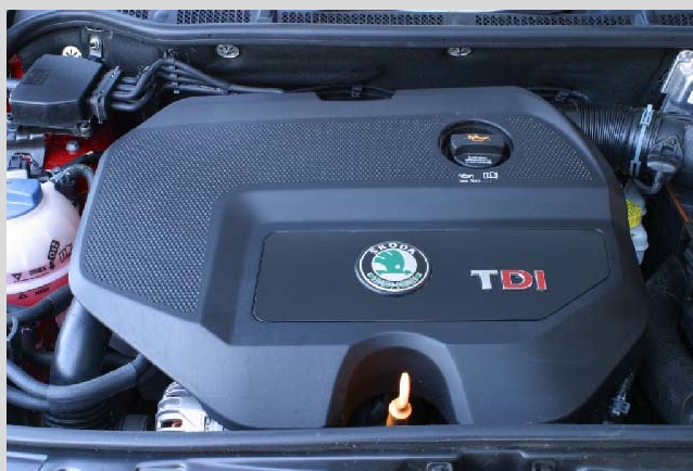
Pictures shown illustrate a variety of models from this range Click for more online