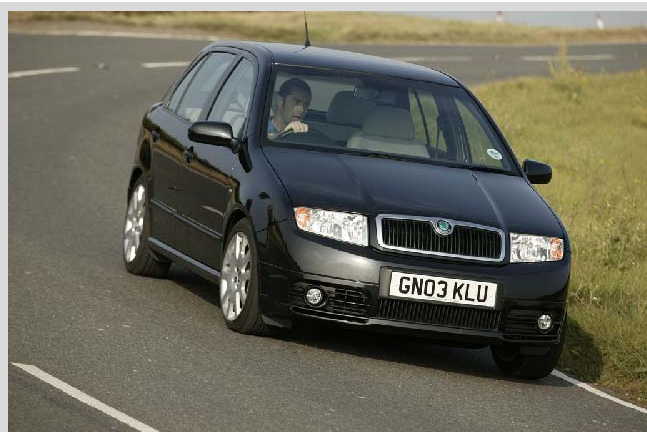
Pictures shown illustrate a variety of models from this range Click for more online