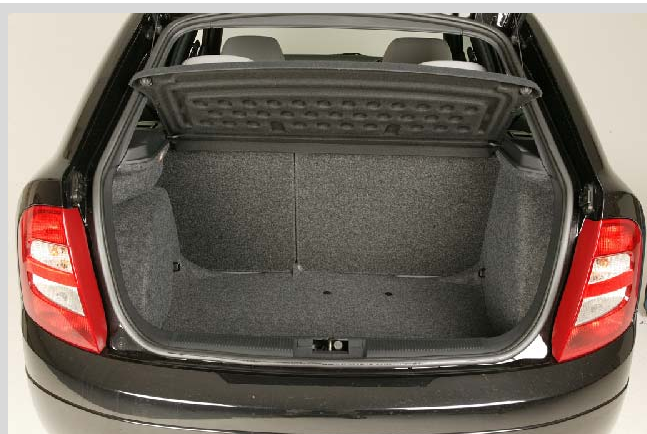
Pictures shown illustrate a variety of models from this range Click for more online